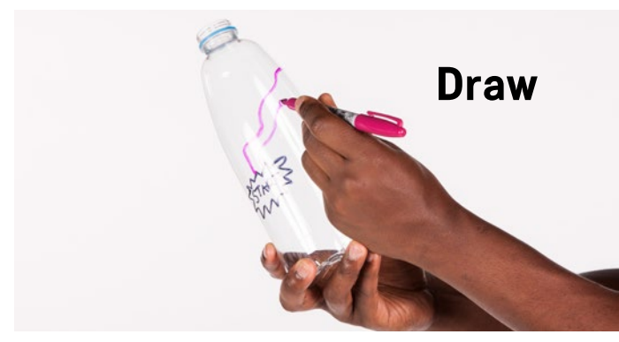
1 Draw a maze onto the bottle with a marker pen.