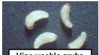
Vine weevil grubs