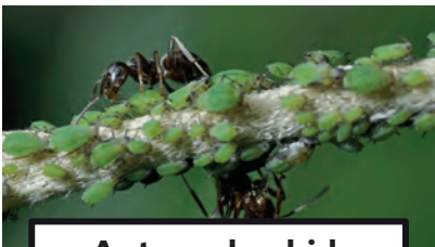
Ants and aphids