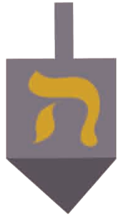
Hay (Half) Take half