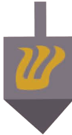
Shin (Put in) Put some in