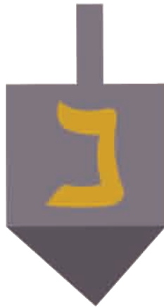
Nun (None) Do nothing