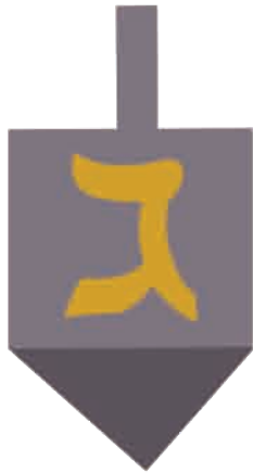
Gimel (All) Take everything